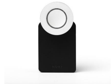
NUKI- Smart Lock at the inside of the front door

When you are in the house, you can simply open the door using the handle. You can lock and unlock the door from the inside by manually turning the silver knob of the NUKI. NEVER press the button. It can lead to errors.