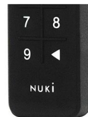
Lock the front door by pressing the triangle

When you leave the house, always lock the house (don't just pull it shut). You lock the house by pressing the arrow / triangle at the bottom right of the keypad. Wait a minute. You will hear the lock turn.